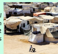
A refugee settlement

With your support, Act for Peace's local partner, (DSPR), provides food ration packs to the vulnerable families, urgent medical referrals, training workshops and psychosocial support.